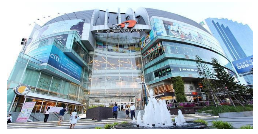
Location: 99 Ratchadaphisek Rd, Din Daeng, Bangkok 10400

The Street Mall – This is a 24-hour lifestyle complex consisting of numerous stalls selling fashion, apparel, cosmetics along with extensive dining options. The Street also has many 24-hour cafés and restaurants as well along with a 24-hour fitness gymlocated at the 2<sup>nd</sup> floor. Location: 139 Ratchadaphisek Rd, Din Daeng, Bangkok 10400