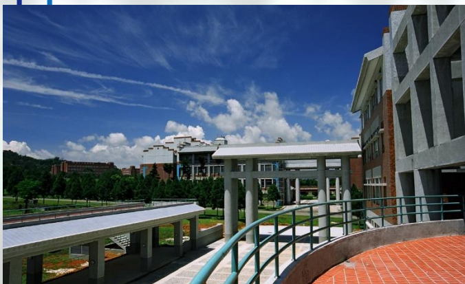
College of Education & Humanities