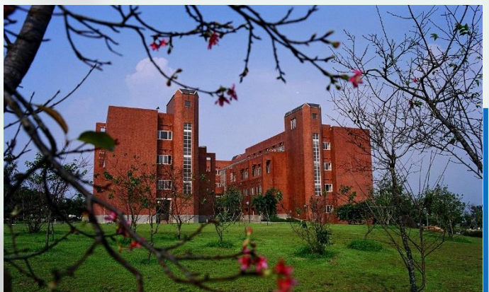
College of Science & Technology