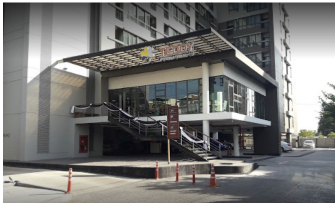
Teddy Modern Service Apartment

Facilities: Air conditioning, Water Heater, Cable TV, Wifi, Key Card, Elevator, Security System