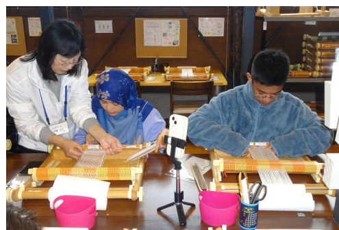
Japanese Culture Experience (Handwoven experience)