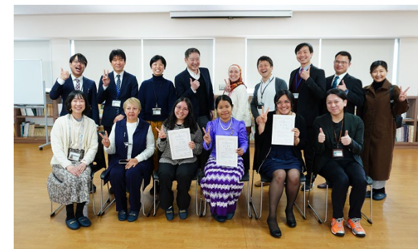
Completion Ceremony of Teacher Training Program