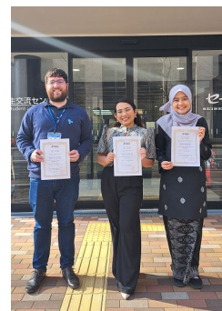
Completion of Intensive Japanese Program

Japanese Language Subjects Japanese Culture Experience Research Required for Completion Research Exercises Required for Completion.