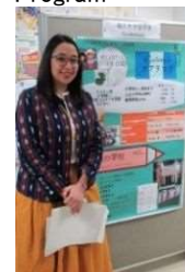
〈Round Table〉 Practitioners and researchers from different regions and occupations come together to share their practices.

Outline: For those who wish to continue with Japanese studies can take Japanese language classes for international students.