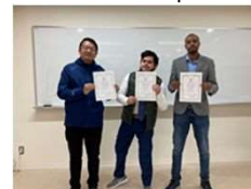
Completion of Intensive Japanese Program