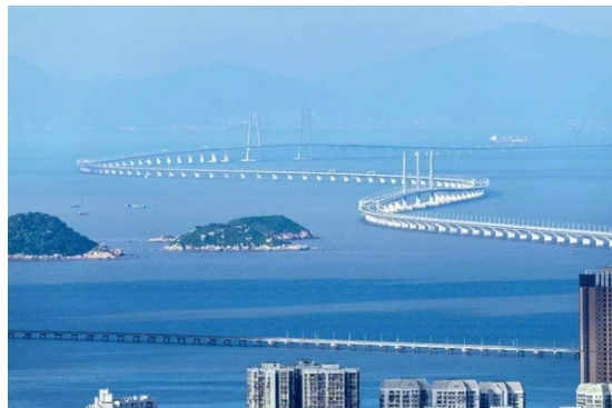
The Hong Kong-Zhuhai-Macao Bridge