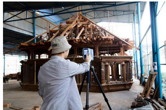
Restoration of Taleju Temple in Nepal

Since its inception, the University has never stopped reaching out to build a transformative and prosperous community.. Technologies from ZJU are found in the outer space as well as the foundation of China's massive infrastructure.