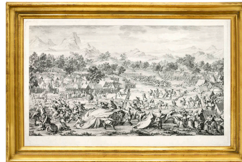
Qianlong Emperor's Copperplate Engraving of the "Conquest of Western Regions"