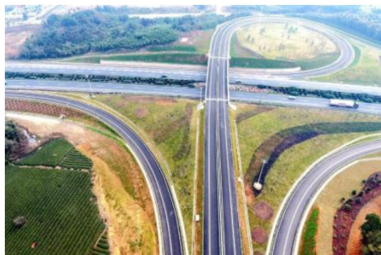
Composite foundation theory and its industrial applications